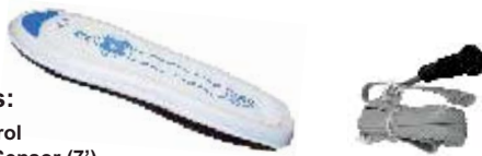
Wireless I/R Remote Kit HQ PT#: 48-0197 (parts available separately)

Kit Includes: Remote Control I/R Receiver Sensor (7')